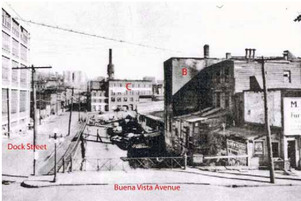
Photo 7. Circa 1900 view of Larkin Plaza from Buena Vista Avenue looking east toward Block C. The Saw Mill River is visible in the northern portion of Block B. This photograph was taken in the same approximate location as Photo 6. Photo from Crandell 1954, pg. 59.