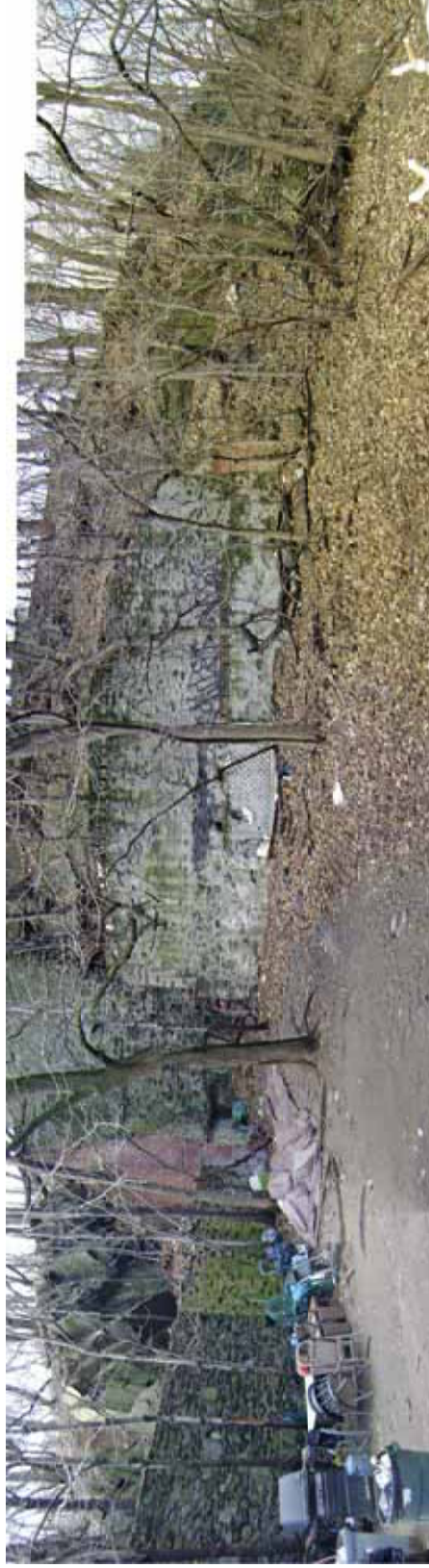
Photo 18. View toward the remains of foundation walls located along the northeastern portion of Block D at the corner of Nepperhan Avenue and New Main/Guion Street. A series of two-story structures was constructed into the steep slope during the late-19th century (Maps 9-12). These structures, utilized at least until the mid-20th century, contained small businesses on the ground floors as well as upper-level apartments.