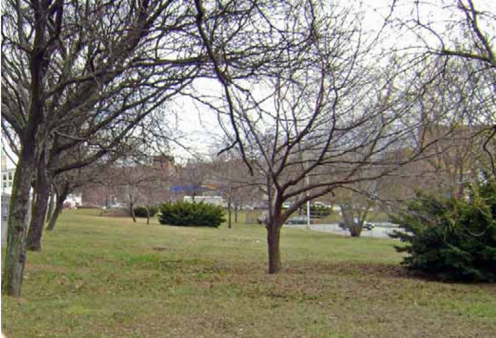
Photo 36. View east of Block K from the corner of James Street and Palisade Avenue. Cellar holes and foundation remains are visible on the surface along the entire northern end of this block.