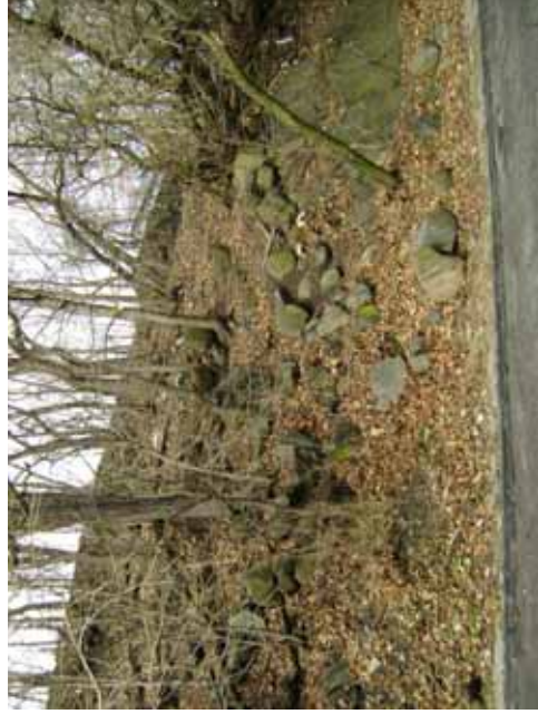
Photo 17. View west toward the steep slope and bedrock outcroppings located along the eastern end of Block D along Guion Street.