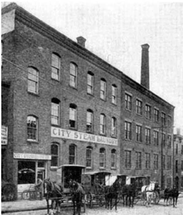
Photo 10. Circa 1902 view of the City Steam Laundry building at 34-36 Dock Street within Block C looking southwest. The reconstructed factory at the former Reed and Carnrick Chemical Works site and the bottling works are visible to the right of the laundry building. From Yonkers Board of Trade c. 1902, pg. 182.