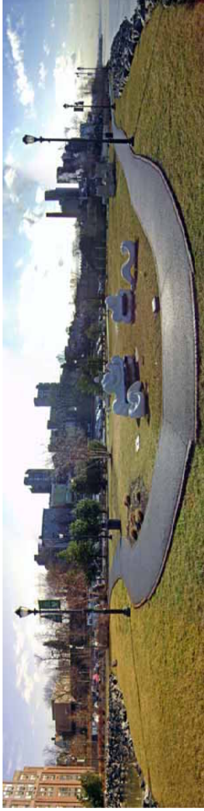
Photo 3. View from the northwest corner of Block A facing southeast along the statue garden and path located between the paved parking lot and the Hudson River within Block A. Modern riprap lines the shore along the park.