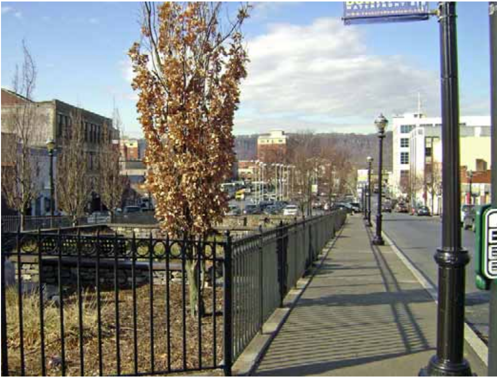
Photo 9. View from the northeastern end of Block C looking west toward Block B. Dock Street is shown (at right) extending along the northern end of Manor House Park and a paved parking area located in the center of the block.