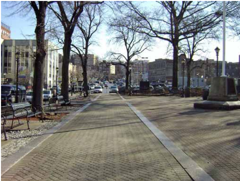
Photo 6. View from the northwestern end of Block B looking east toward Block C along the covered location of the Saw Mill River. Larkin Plaza Park occupies the western end of Block C, while a paved parking lot, seen in the background, occupies the eastern end of Block B.