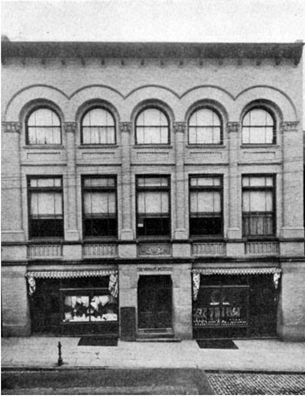
Photo 38. Circa 1902 view south of the Women's Institute at 36-38 Palisade Avenue within Block K.