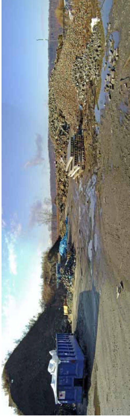
Photo 4. View southwest from the southern end of the paved parking lot within Block A showing mounds of rubble. The entire southern portion of the block contains mounds of rubble, which might have been pushed to the end of the block when the northern portion was remediated.