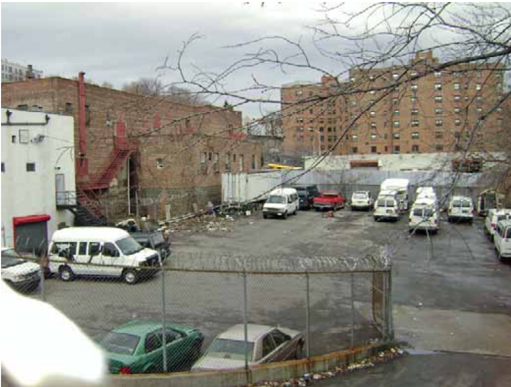
Photo 35. View north toward the paved parking area located in the eastern side of Block J. The Alexander Smith and Sons tapestry weaving mill was located here from the mid-19 th century until the 1930s. Two 20 th century structures, a car repair shop (white building) and a building containing shops, are located within the western side of the block.