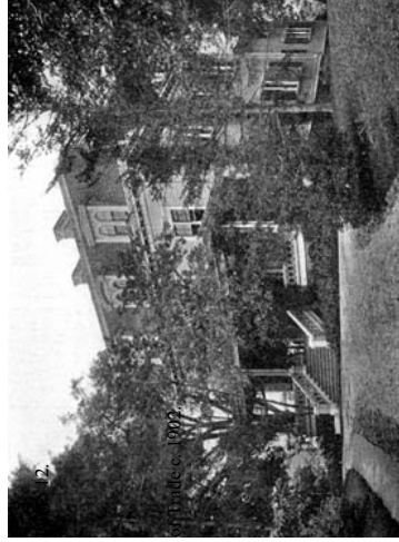
Photo 12. Circa 1902 view of the Baldwin/Waring estate house located on South Broadway, within Block D. From Yonkers Board of Trade, c. 1902.