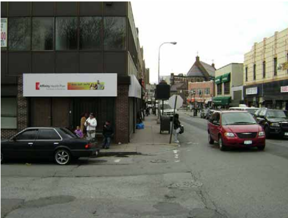
Photo 24. View west toward Block G (left) from the corner of James Street and Palisade Avenue.