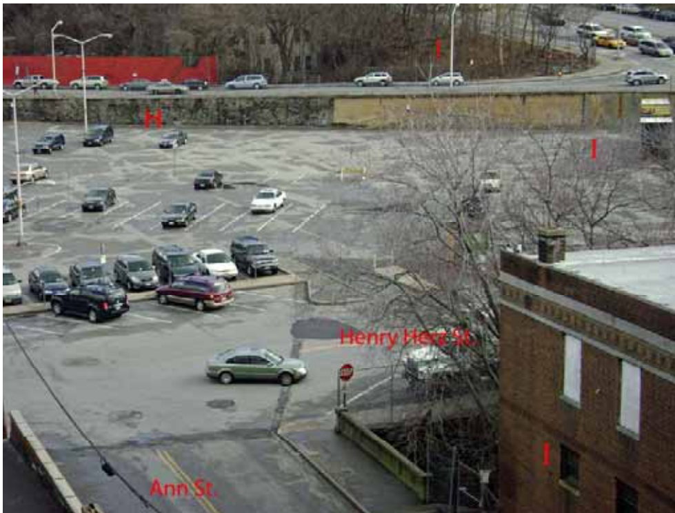
Photo 26. View east towards Blocks H and I from the parking garage located in Block E. New School Street, constructed c. 1917 and visible in the background, elevates gradually as it extends south along the Chicken Island parking lot.