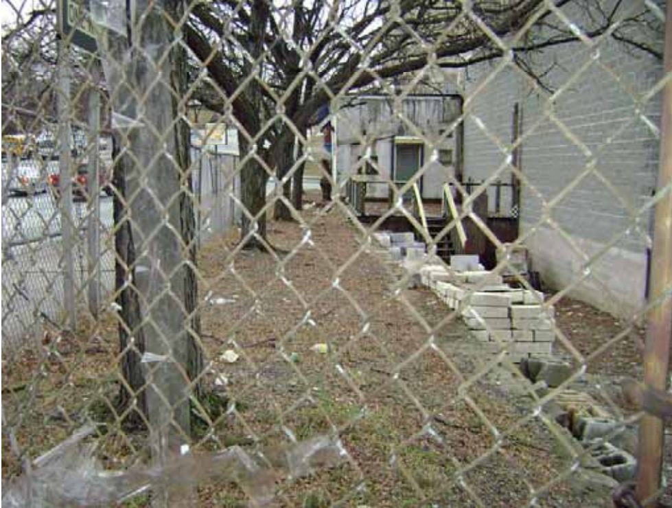
Photo 30. View southwest along the northern side of Nepperhan Avenue from Henry Herz Street. Nepperhan Avenue was extended north into the footprints of the late-19 th and early-20 th century commercial/residential structures fronting Nepperhan Avenue. The rear foundation walls of these structures are currently visible along the right side of the photo.