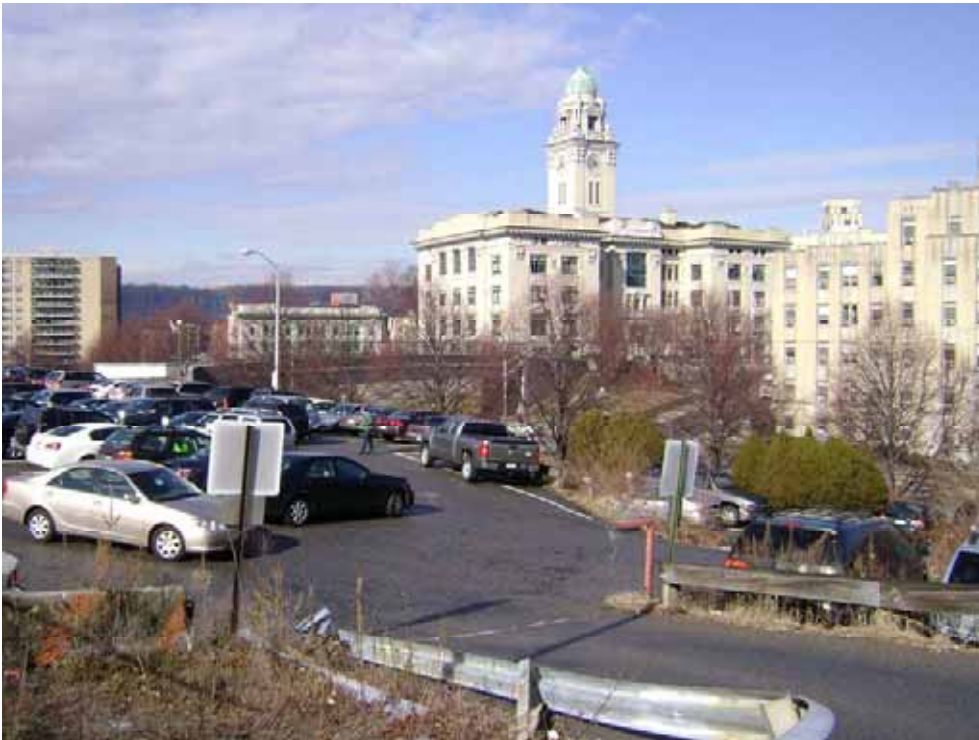
Photo 16. Northwestern view of the terraced parking lot within the northern section of Block D. City Hall, located across Nepperhan Avenue from the Cacace Center project area, is visible in the background.