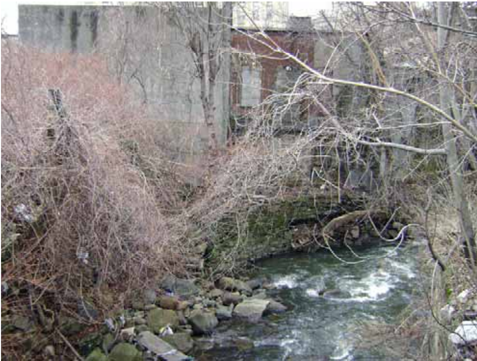
Photo 29. View west showing the curve of the Saw Mill River and 19 th century retaining wall west of Henry Herz Street. A livery and morocco leather factory were located within this area south of the river bend (left side of photo) during the 19 th century (Maps 8-10).