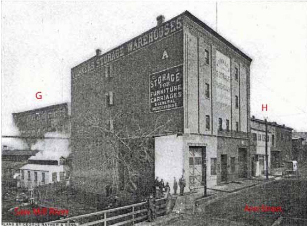
Photo 25. View from the Ann Street bridge over the Saw Mill River east towards the Yonkers Storage Warehouse building at 11-17 Ann Street in Block H between 1886 and 1898. The Waring Hat Manufacturing factory located on James Street in Block G is visible on the left side.