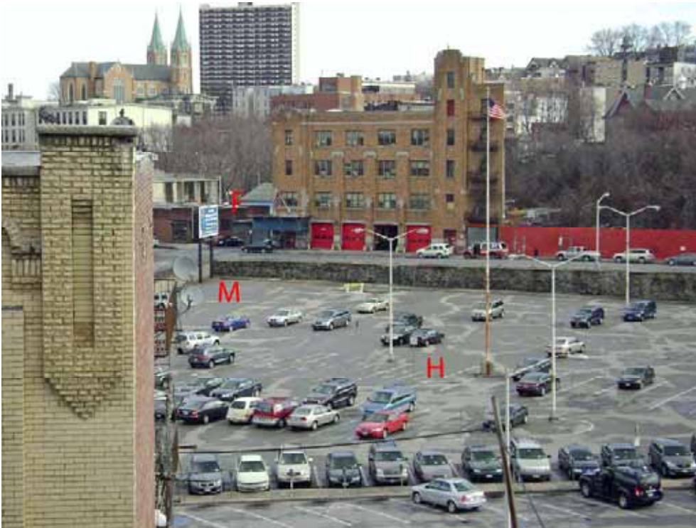
Photo 21. View east toward Blocks F, H, and M from the parking garage located in Block E. Blocks H and M are now contained within the Chicken Island parking lot. The fire department headquarters building (c. 1927), as well as New School Street (c. 1917), is visible.