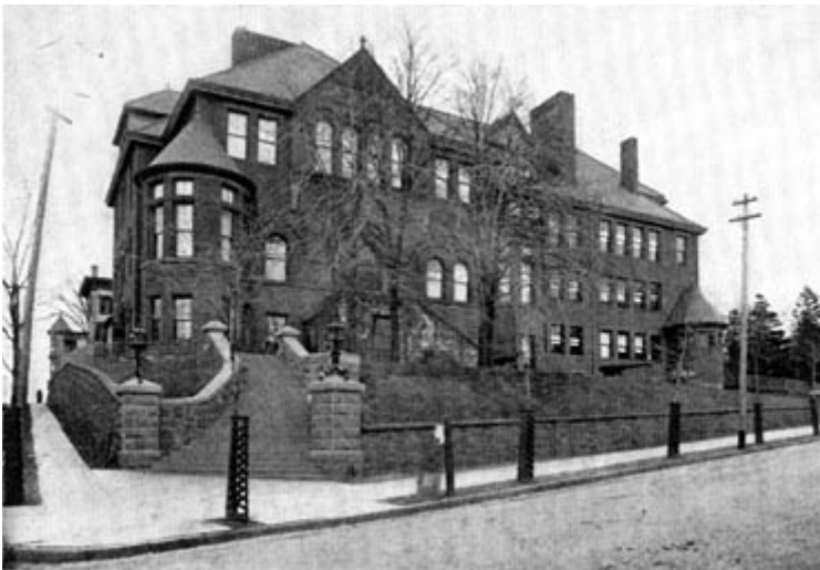
Photo 14. Circa 1902 view of Yonkers High School at the southeast corner of Nepperhan Avenue and South Broadway in Block D.