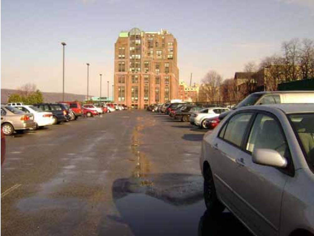
Photo 1. View north showing the paved parking lot located in the northeast section of the Palisade Point project area (Block A).