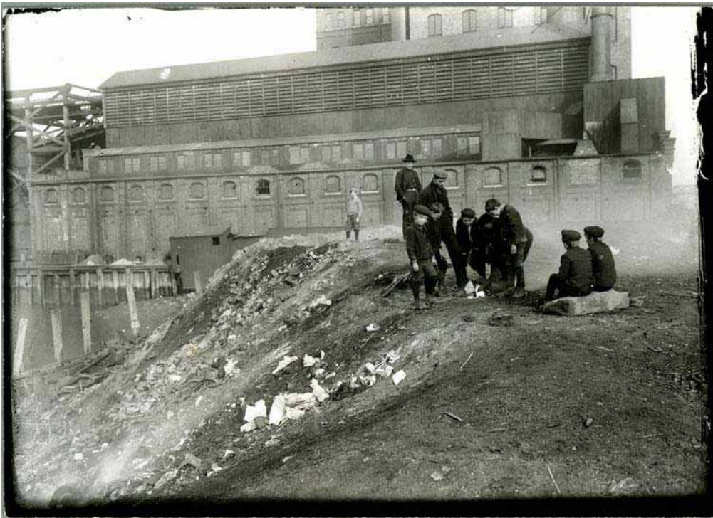
Photo 2. Historic view c. 1906 of sugar refining mill and steep bank along Hudson River prior to modern filling near Block A facing north.