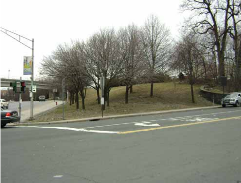
Photo 13. View of the northwest corner of the Block D at the corner of Nepperhan Avenue and South Broadway. Nepperhan Avenue was originally straight and extended through this section. Remains of the stone retaining wall are still visible (right side of photo) within this portion of the project area (Maps 10 and 11).