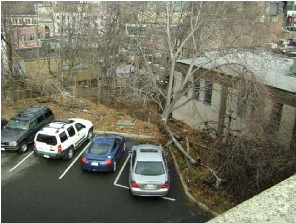
Photo 20. View north toward the terraced parking area located at the rear of the Salvation Army building at 110 New Main Street from the roof of the six-story parking garage.