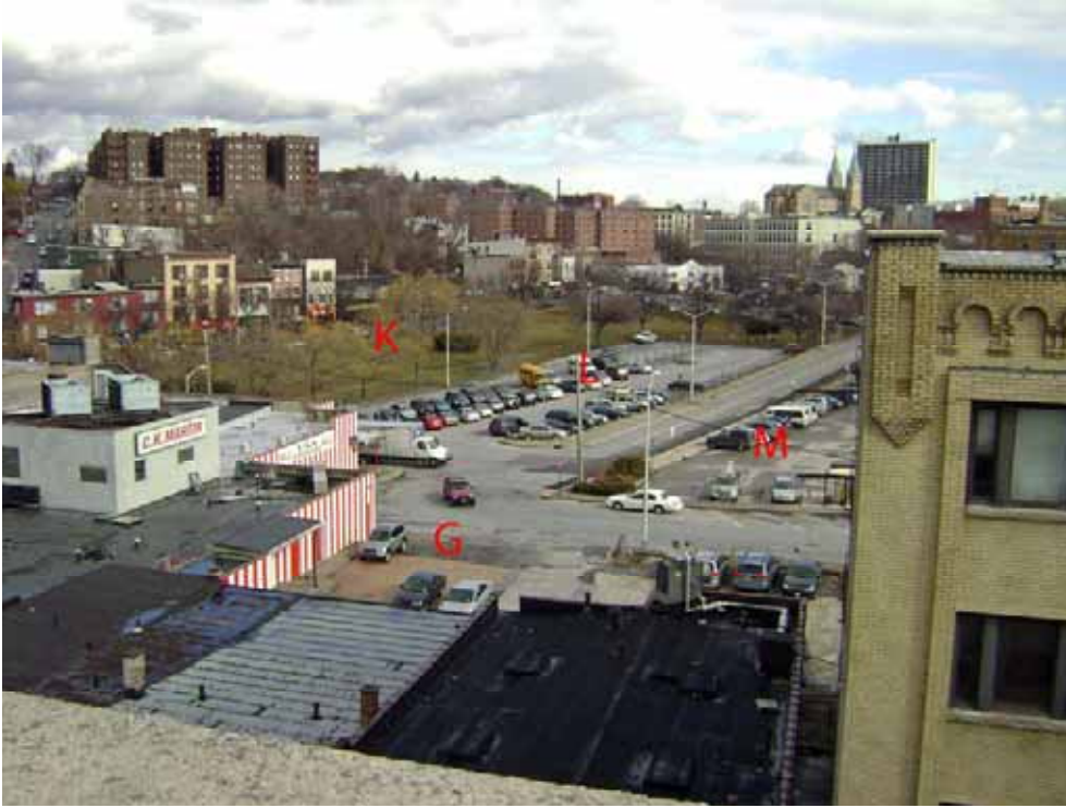
Photo 23. View northeast toward Blocks G, K, L, and M from the parking garage located within Block E. The roofs of the single-story, early-20 th century structures within Block G are visible in the foreground; the covered Saw Mill River flows behind these buildings.