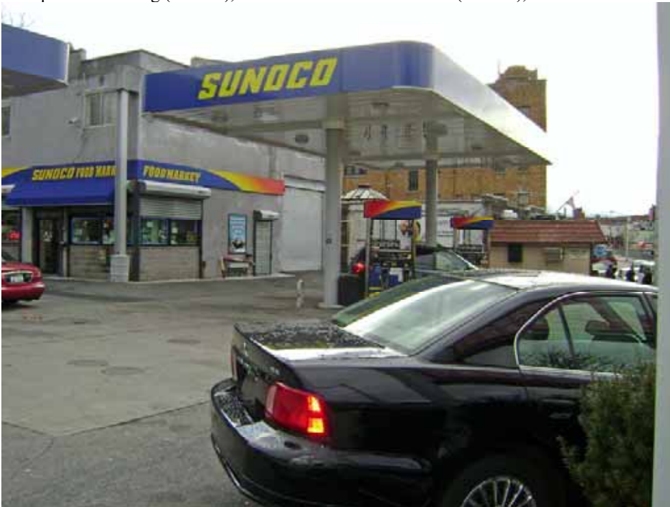
Photo 22. View south from the corner of Elm and New School Streets towards the gas station and fire department headquarters located within Block F.