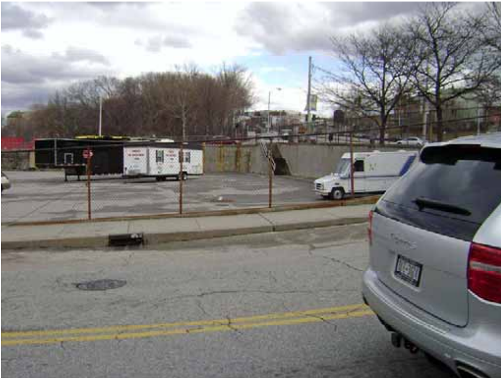
Photo 31. View northeast toward the center of Block I, located within the Chicken Island parking lot. Nepperhan Avenue (right) and New School Street (background) are elevated above the block within this area.