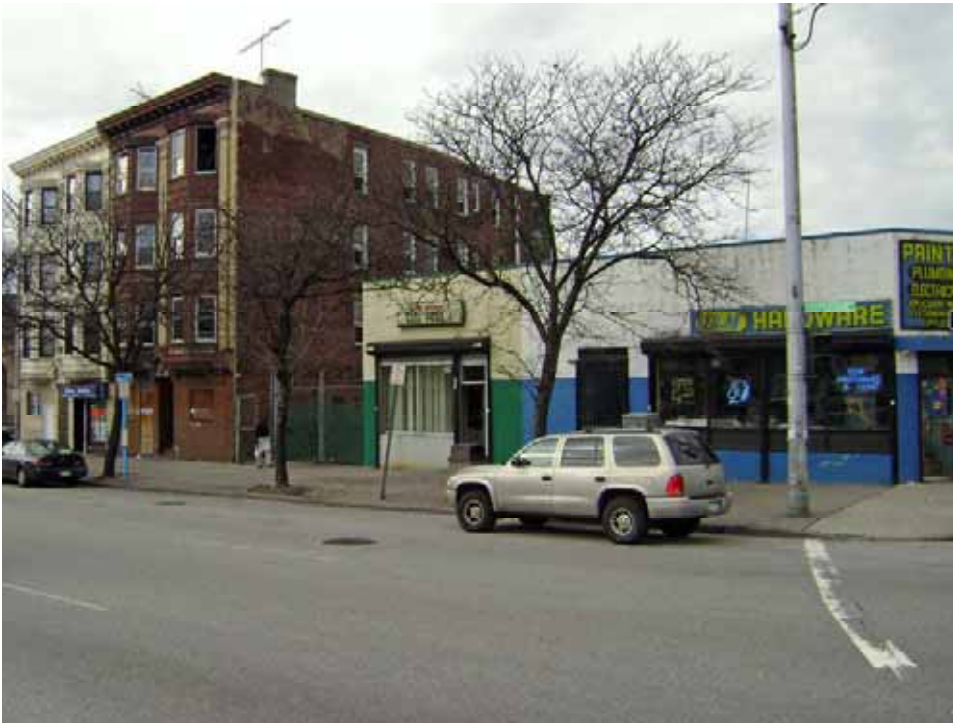
Photo 41. View west toward the northeastern end of Block N from the Nepperhan Avenue median. The four-story tenement building dates to the late-19 th or early-20 th centuries, while the single-story commercial structure possibly dates to the mid-19 th century.