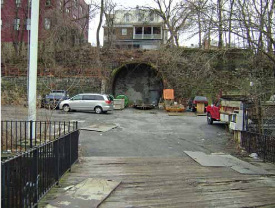
Photo 40. View east toward an underground vault located along the eastern edge of Block N. The vault is depicted on the 1886 Sanborn map (Map 9) and is surrounded by a 19 th century retaining wall.