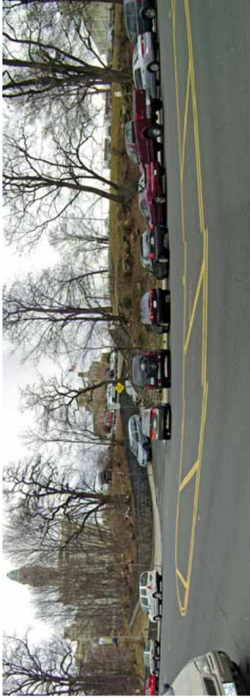
Photo 11. View east from South Broadway toward the western end of the Cacace Center project area (Block D). The justice center's paved parking lot is visible at the top of the rise. The Yonkers High School complex was once located (c. 1886 to post 1917) within the western section of the block – on the rise in the left side of the photograph. The Baldwin/Waring estate house was once located (c. 1868 to post 1917) within the southwestern end of the block – just past the rise on the right side of the photograph.