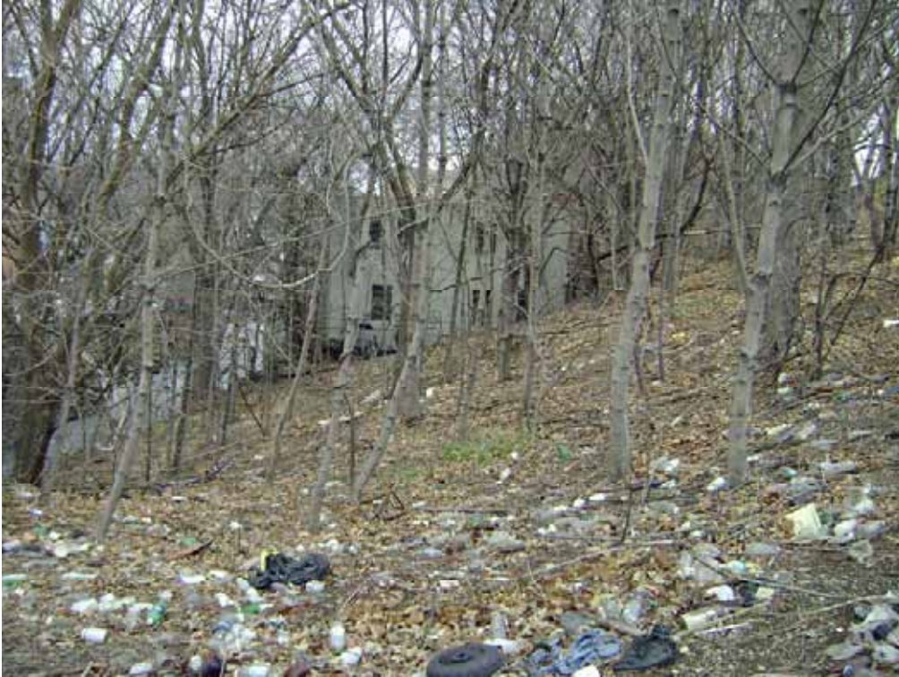
Photo 32. Eastern view of the northern portion of Block I from New School Street. Single-family homes, tenements, and small businesses once fronted Nepperhan Avenue at the top of the steep slope, while the rear yards were located along the slope. The structure in the background is located at the southern end of Block N.