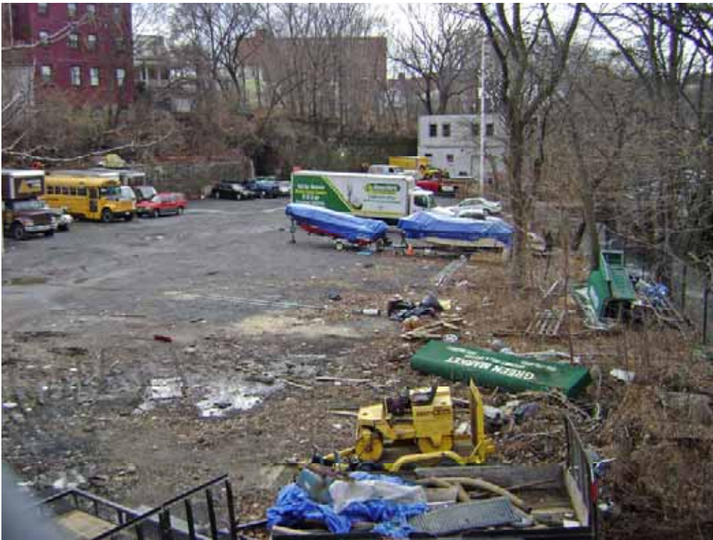
Photo 39. Southern view of the western end of Block N from Elm Street. The Rose, McAlpin and Company leather factory occupied this area from at least 1886 until at least the mid-20 th century. The Saw Mill River is visible on the right side of the photo, while a 19 th century stone retaining wall is visible on the left.