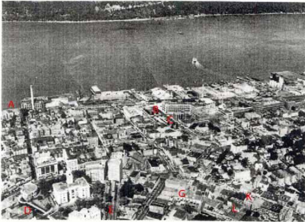
Photo 5. Circa 1946 aerial image of the City of Yonkers facing west. All or part of blocks A-E, G, L, and K are visible.