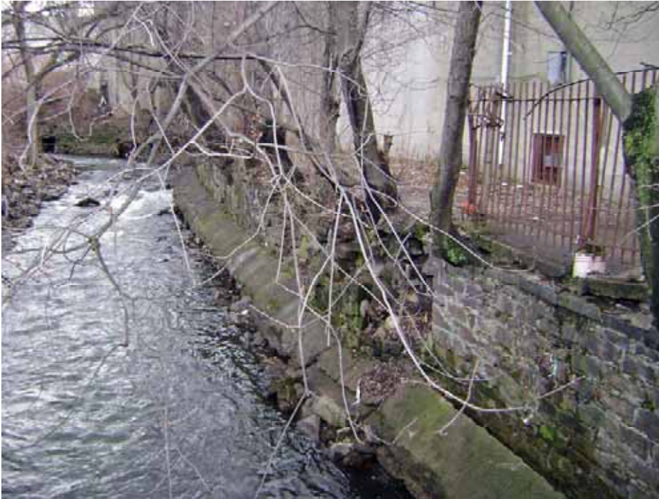
Photo 28. View southeast along the uncovered Saw Mill River within Block I from the Ann Street bridge. Nineteenth century walls, possibly retaining walls or building foundation remains, are visible lining the river.