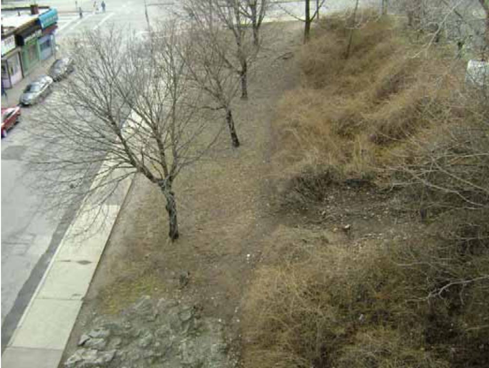
Photo 19. View of the southeastern corner of Block E from the roof of a six-story parking garage located within the center of the block. This photograph shows one of the only unoccupied areas within the block.