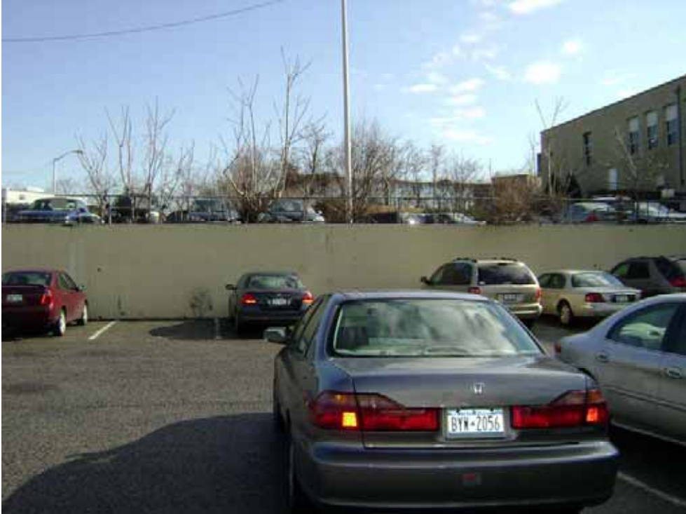
Photo 15. East view of the southern portion of Block D from within the terraced parking lot. The northern portion of Block D appears terraced on the 1898 Sanborn map. While it is not clear when terracing occurred within the southern portion of the block, the eastern end of the parking lot seems to follow a natural slope.