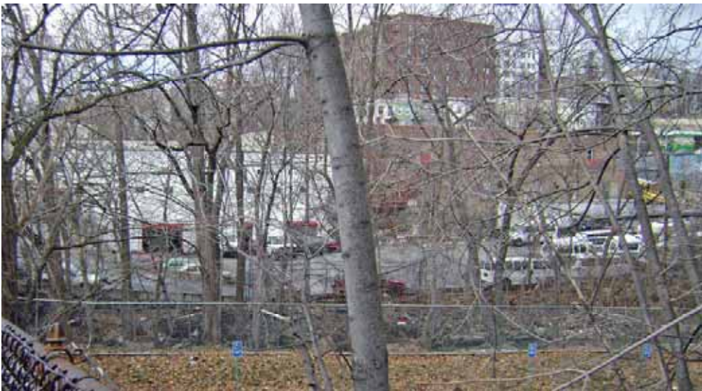
Photo 33. View west toward Block J, the former location of the Alexander Smith and Sons tapestry weaving mill, located on the west side of the Saw Mill River.