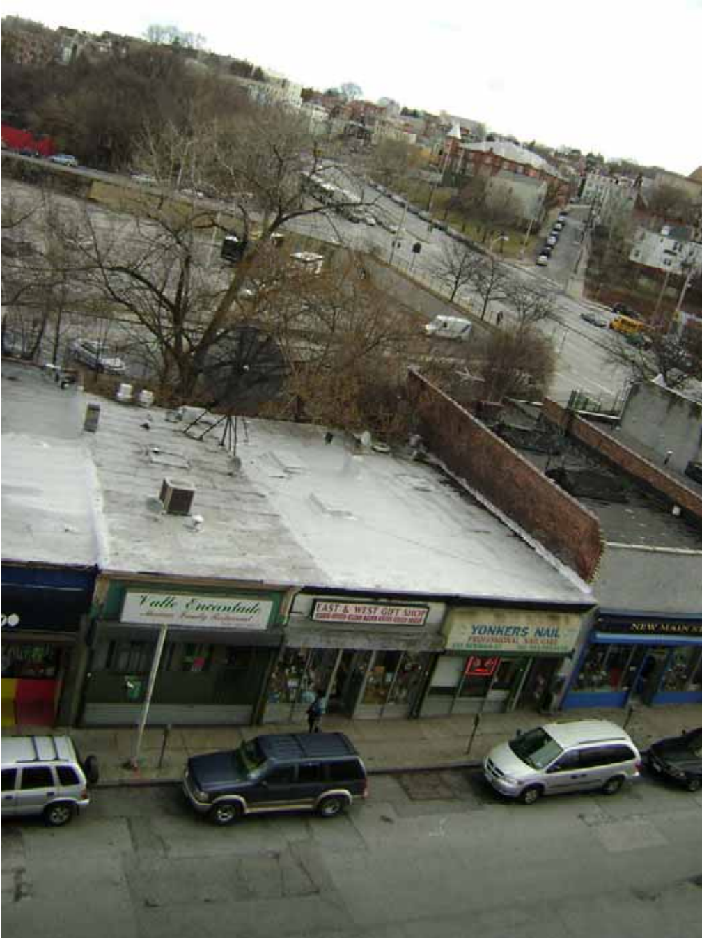
Photo 27. View east toward Block I from the parking garage located within Block E. The 20 th century single-story shops fronting along New Main Street are shown in the foreground.