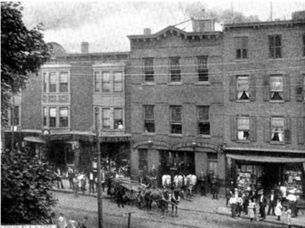
Photo 37. Circa 1902 view south of the fire station at 18 Palisades Avenue, located within Block K. The fire station is in the center of the photo. From Yonkers Board of Trade c. 1902, pg. 141.