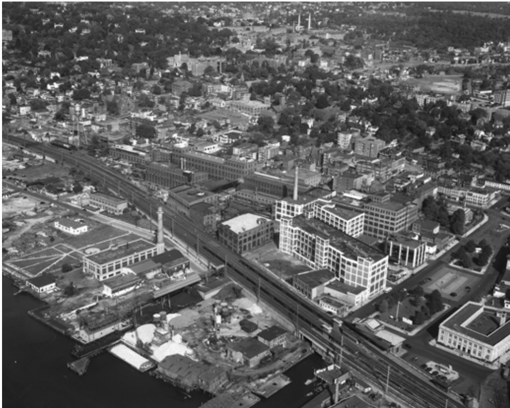
Photo 8. 1946 Fairchild Aerial Survey of Yonkers. Larkin Plaza (Blocks B and C) is in the lower right corner.